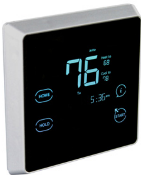
Fig. 1 - Côr 7 / 7C Programmable Thermostat