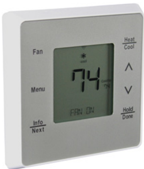
Fig. 2 - Côr 5 / 5C Programmable Thermostat

The Côr Series of thermostats consists of Wi-Fi and non-Wi-Fi air conditioner, heat pump and Thermidistat controls. These units feature non-mercury, non-lead based electronic controls built into a subtle, slim plastic enclosure.